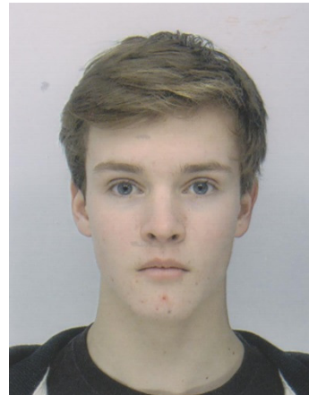
Assistant Instructor to the Plymouth Schools of Karate, Devon. Examiner Level 3/4b.