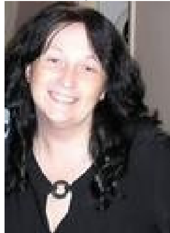
Assistant Director of Academia & Assessment.