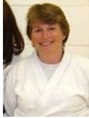
Assistant Instructor to the Cranleigh Karate Club and Cranleigh School Karate Club, Surrey.