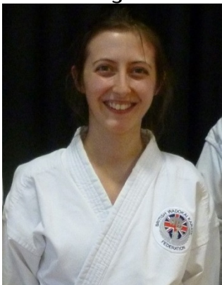
Assistant Instructor of East West Wado Karate, Newcastle, Tyne & Wear. Examiner Level 1.