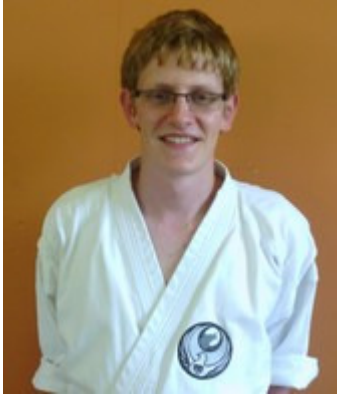
Instructor to the Grey Wolf Wadoryu Karate Club, Cirencester, Gloucestershire. Examiner Level 3/4b.