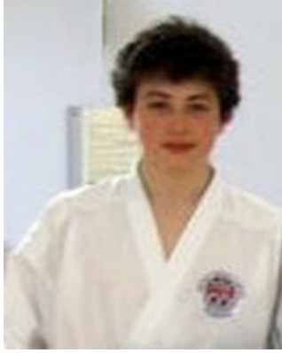
Assistant Instructor to the Zanshin Karate Club, Burgess Hill, Sussex.