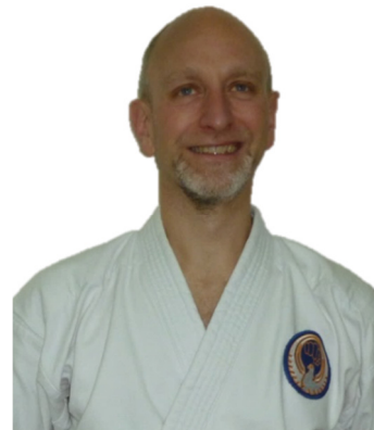
Instructor to the Plymouth Schools of Karate, Devon. Examiner Level 1.