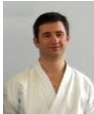
Instructor to the Cranleigh Karate Club, Surrey. Examiner Level 3/4d.