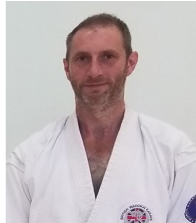
Instructor of the Kingslea School Horsham Wado Karate Club, Sussex. Examiner Level 1.