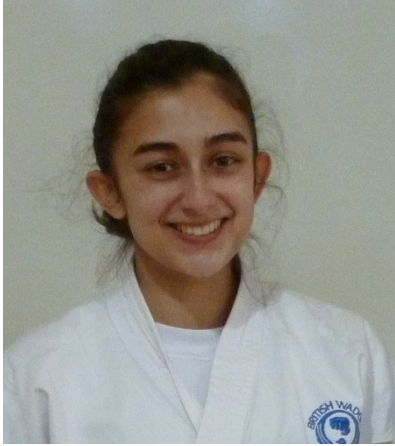
Instructor to Manchester Wadoryu Karate Club, Heywood, Lancashire. Examiner Level 1.