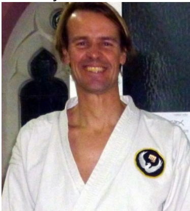
Instructor to the Plymouth Schools of Karate, Devon. Examiner Level 3/4b.