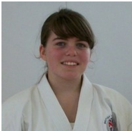
Assistant Instructor to the Zanshin Karate Club, Burgess Hill, and Kingslea School Horsham Wado Karate Club, Sussex.