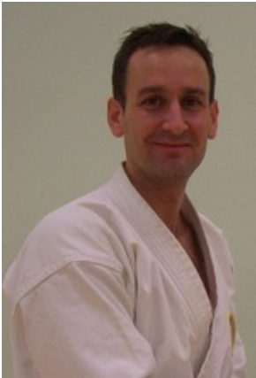
Assistant Instructor to the Kingslea School Horsham Wado Karate Club, Sussex.