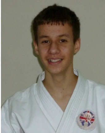
Assistant Instructor to the Plymouth Schools of Karate, Devon. Examiner Level 2.