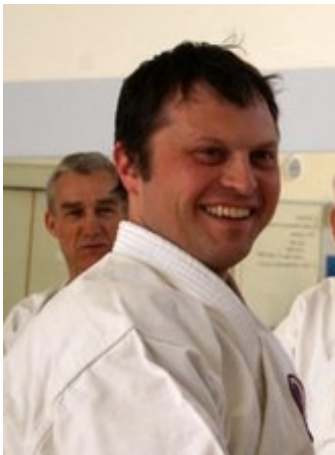
Senior Instructor to the Plymouth Schools of Karate, Devon. Examiner Level 3/4d.