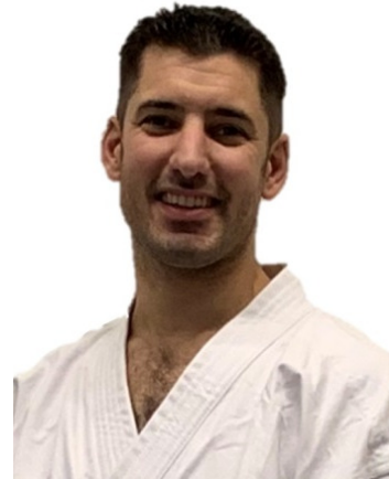
Senior Instructor to Kaiyo Wado Kai Karate Llangennech, Carmarthenshire Examiner Level 1.