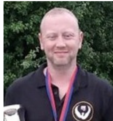
Assistant Instructor of East West Wado Karate, Newcastle, Tyne & Wear. Examiner Level 3/4b.