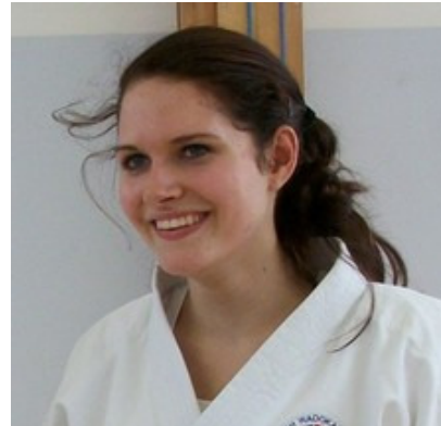
Assistant Instructor to the Zanshin Karate Club, Burgess Hill, and Kingslea School Horsham Wado Karate Club, Sussex.