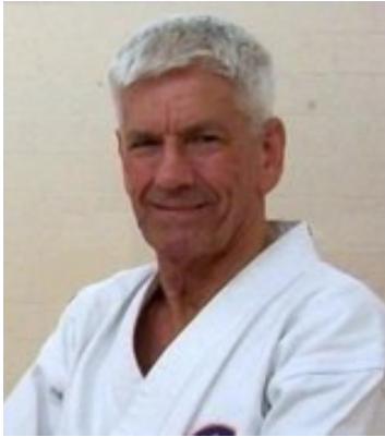
Senior Instructor of the Kingslea School Horsham Wado Karate Club, Sussex. Examiner Level 3/4f.