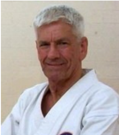
Director of Academia & Assessment.