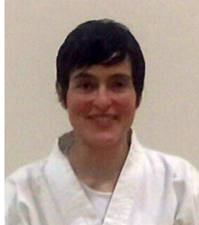
Instructor of East West Wado Karate, Newcastle, Tyne & Wear. Examiner Level 1.