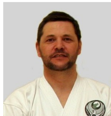
Assistant Instructor to the Grey Wolf Wadoryu Karate Club, Cirencester, Gloucestershire. Examiner Level 3/4b.