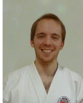
Senior Instructor to Zanshin Karate Club, Burgess Hill, Sussex. Examiner Level 3/4b.