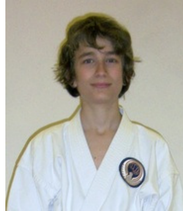
Assistant Instructor to the Plymouth Schools of Karate, Devon. Examiner Level 2.