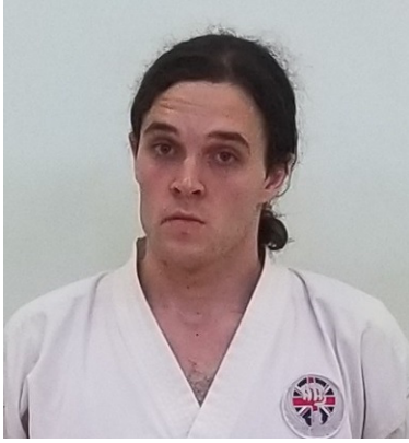
Instructor of the Cranleigh Karate Club (Hakutsuru), Surrey. Examiner Level 1.