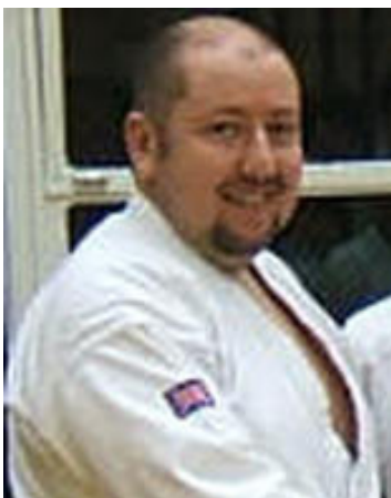
Senior Advisor to the Zanshin Karate Club, Burgess Hill, Sussex.