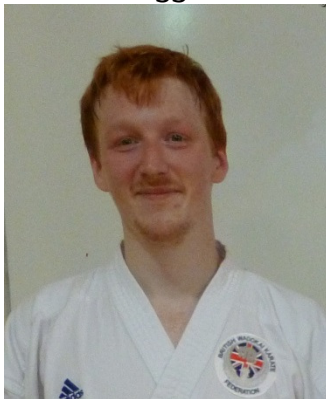
Leading Instructor to Manchester Wadoryu Karate Club, Heywood, Lancashire. Examiner Level 2.