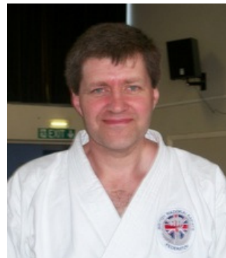
Senior Instructor to the Zanshin Karate Club, Burgess Hill, Sussex.