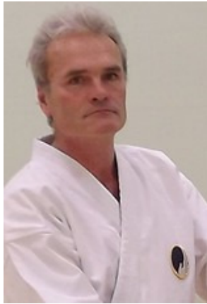
Assistant Instructor to the Kingslea School Horsham Wado Karate Club, Sussex.