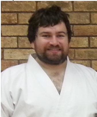
Assistant Instructor of East West Wado Karate, Newcastle, Tyne & Wear. Examiner Level 3/4b.